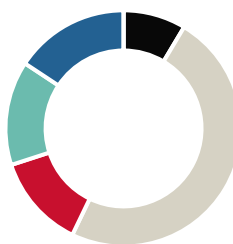
Votes against management by topic (%)**