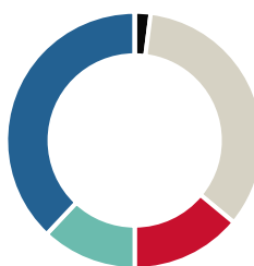
Votes against management by topic (%)**